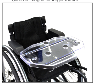
TRAY TABLE BAMBINO 3